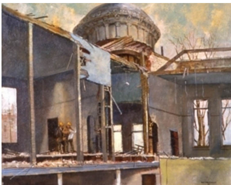
The demolition of the Guelph Carnegie Library, one of a series of paintings depicting this iconic building. Macdonald Stewart Art Centre collection.

Spencer's book is available for sale at the Macdonald Stewart Art Centre.