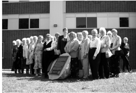
GGH School of Nursing Alumnae

The School for Nurses (1888-1974) [later known as the School of Nursing] began with the completion of the Victoria Jubilee Wing. It had five nurses-in-training and two probationers, and was a two-year course. The course was extended to three years from 1896-1971. In 1889 the first exams were held and two candidates, both prior staff members of the GGH, passed with credit. The School