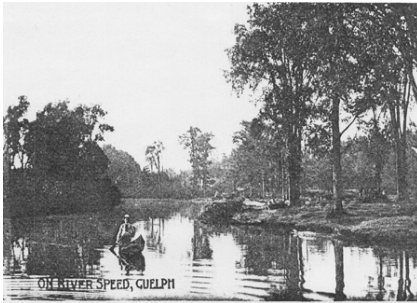
The Speed was used for many recreational activities including canoeing, skating and curling.

Speed River both in natural and human terms.